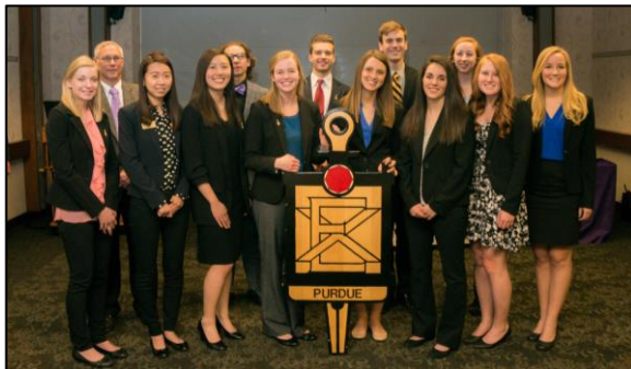
Spring 2016 Officers