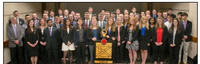
Above: Spring 2016 Officers and Active Members Left: Chi Epsilon Buddy Bowling Night