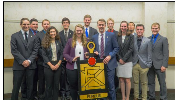
Fall 2016 Officers