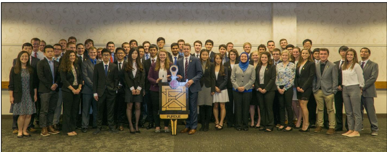
Fall 2016 Officers, Actives, and Pledges

Mail to: Purdue Chi Epsilon 550 Stadium Mall Drive West Lafayette, Indiana 47907