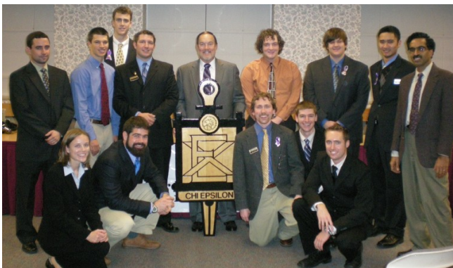
Chi Epsilon Fall 2007 and Spring 2008 Officers

We wish all of the new officers continued success within the organization and are sure they will maintain and strengthen the Purdue University Chapter of Chi Epsilon. We also hope that those leaving Chi Epsilon will continue to succeed as they have within the organization.