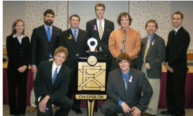
Chi Epsilon Spring 2008 Officers