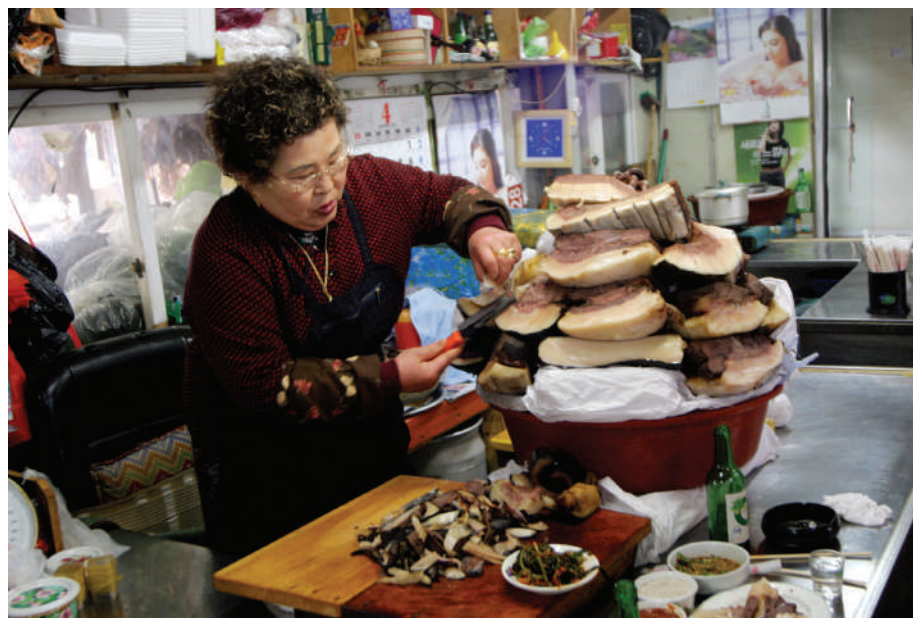
Figure 1 | Whale for sale. This parboiled minke-whale meat from the East Sea (Sea of Japan) is on offer at a shop in South Korea. A five-year estimate 1 based on individual genetic identification of whale products in South Korea shows that almost twice the number of minke whales were accidentally killed in fishing gear compared with official estimates. Especially given the large number of minkes from the same population that are accidentally killed and landed in Japan, this rate of loss is likely to be unsustainable.

ecologists, setting up a genetic capture-recapture study. Mark-recapture surveys in ecology seek to estimate the number of animals in a population by releasing a known number of marked individuals, and then estimating total population size based on the fraction of marked individuals recaptured 4 . Capture-recapture methods use individual identification tools such as DNA genotype analysis instead of marks 5 . And like a typical experiment in ecology, the chance of identifying the same whale twice in a market depends on the whale's 'lifespan' in the market — how long meat samples from an individual whale last before they are all sold. To estimate this figure, a co-author, Justin Cooke, developed