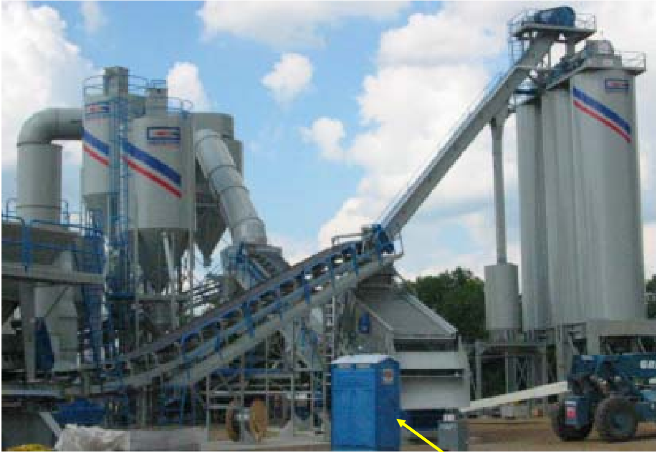
Asphalt Plant and Drivers Lounge