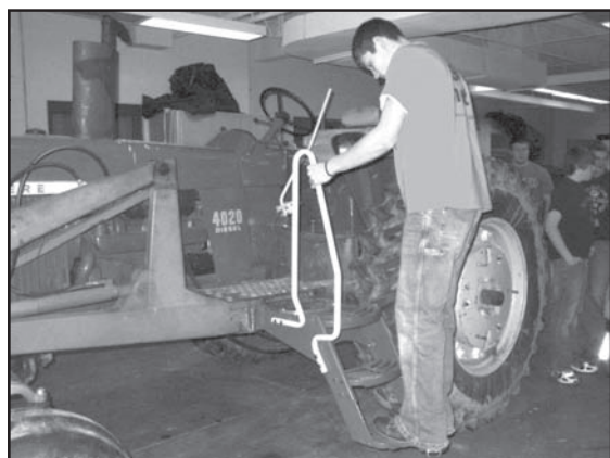
North Montgomery's tractor modifications