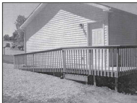
West Washington's ramp and deck extension

West Washington FFA entered the Bridging Horizons Contest for the fourth time and took home their fourth award. This year, the chapter made modifications to a local Habitat for Humanity house by building a ramp with an extension to the existing deck. They also