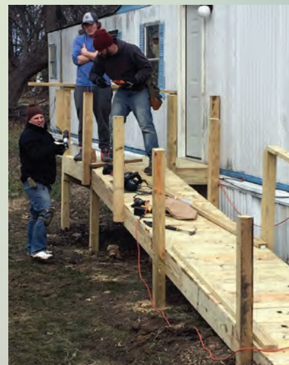
Members of the Embassy Men group build a wheelchair-accessible ramp

Second place went to Forest Park FFA of Ferdinand, IN, which built an accessible cart that enabled an elementary school student with a disability to deliver library books in his school. Springs Valley Jr./Sr. High School's construction technology program, Fellowship of Christian Athletes group, and FFA partnered to win third place by completing several projects during the year, including wheelchair-access ramps.