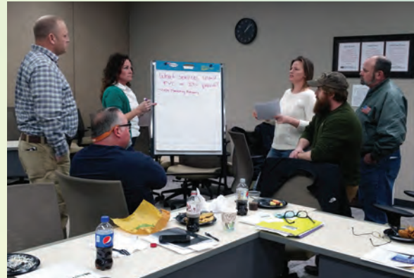
Indiana farmer veterans discuss the new FVC chapter

The core group of leaders is working to get the required organizational paperwork completed and an initial stakeholders meeting scheduled by the end of the year. The chapter will then be able to provide direct assistance to Indiana's farmer veterans. Look for more details in an upcoming News Note.