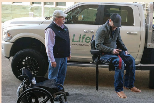
The NTW offers many opportunities to learn new things, network with peers and professionals, and try out assistive technologies

Visit www.agrability.org/ntw for more information.