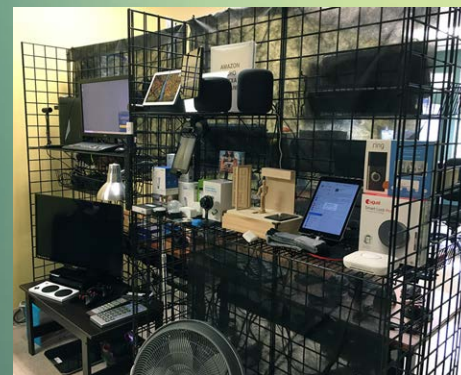
A multitude of accessible electronic devices, and other AT, are available for loan

Easterseals Crossroads and Purdue University staff members are also working to establish a satellite loan library in Purdue's Depart-