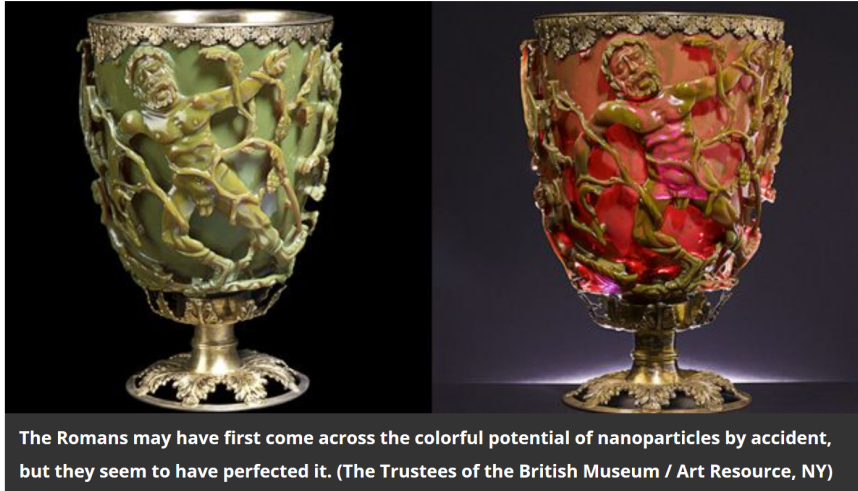
Figure 3: Courtesy of Smithsonian.com.

https://www.smithsonianmag.com/history/this-1600-year-old-goblet-shows-that-the-romans-were-nanotechnology-pioneers-787224/