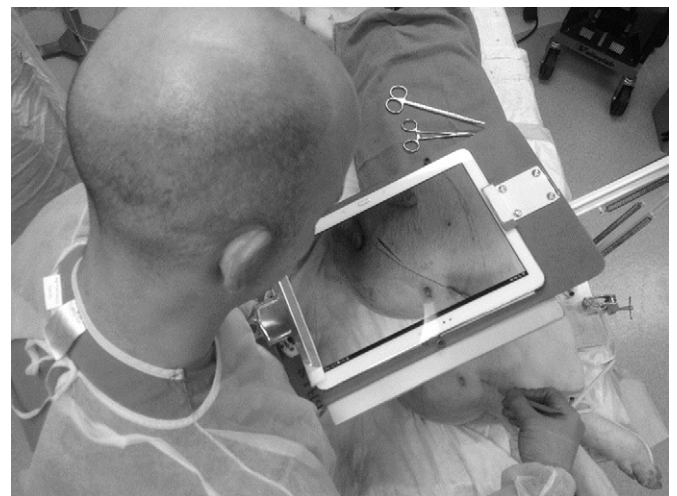
FIGURE 3. A resident surgeon at an Advanced Trauma Operative Management course uses the STAR remote subsystem to complete a fasciotomy on a euthanized porcine model under telementored guidance

Subsequent development incorporated the formative feedback provided by the surgeons after the conclusion of the test operation. For example, the mechanical assembly holding the local subsystem over the operating field was redesigned to be more stable. In addition, the remote expert surgeon reported that more free-form drawing tools like lines and circles were favored as annotations over more complex placement of icons. This suggests that the value of