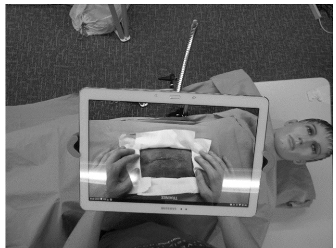
FIGURE 1. The STAR local subsystem, as seen from the local surgeon's perspective.

Figure 2 shows the remote subsystem. The remote subsystem contains a display that allows a remote expert surgeon to view the operating field in real time. Because the