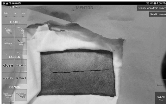
FIGURE 2. The STAR remote subsystem. An annotation representing an incision (dark line in operating field) has been drawn by the remote user.

position of the local subsystem's camera is similar to the local surgeon's viewpoint, the remote surgeon is able to view the operating field from approximately the same perspective as the local surgeon. The remote subsystem also contains a touch-based user interface, which allows the remote surgeon to draw annotation on top of the surgical view. These annotations include instructional visuals (e.g., lines and shapes), and icons of surgical instruments or predefined textual labels. The annotations are actionable physical knowledge conveyed to the local surgeon. These placed annotations can be moved, rotated, or scaled by the remote surgeon. Once the remote surgeon has finished creating a set of annotations of the current operating field imagery, the annotations are wirelessly transmitted to the local subsystem.