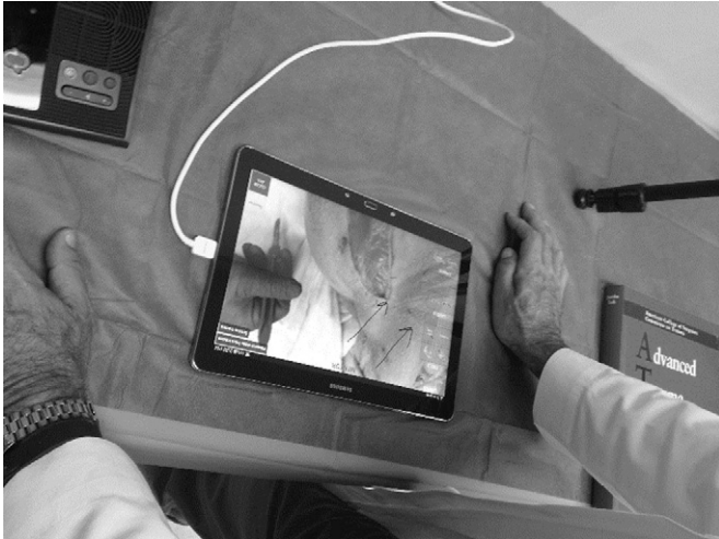
FIGURE 4. A remote surgeon provides guidance using STAR to provide telementored guidance to a local surgeon. Annotations (dark arrows) were drawn by the remote user and transmitted to the local surgeon's view of the operating field.

telementored annotation was in quick arrow-like indications, rather than a more detailed but slower construction of a more photorealistic illustration.