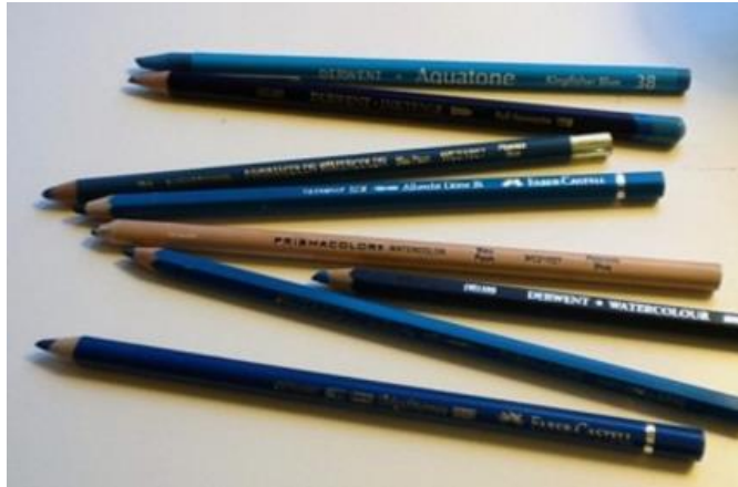
Fig 04: Watercolor Pencils

2. Two Sharpies with different stroke width (preferably fine and ultra-fine). We recommend you buy the twin-tip Sharpie that has both the fine and ultra-fine tips on the same pen.