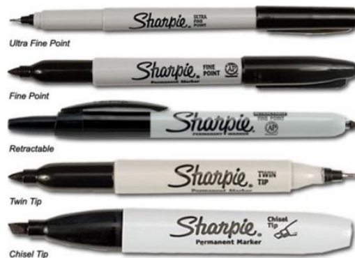
Fig 05: Sharpies

3. Post-it notes (preferably 3"x3") – Note: These are essential for ideation, organization and classification of ideas and workflows. You may Use Google Jamboard for virtual post-it notes if your meetings are remote.