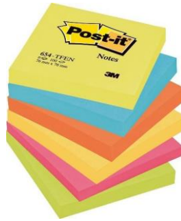
Fig 06: Post-it Notes