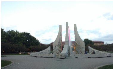
(b) Image from pair 2