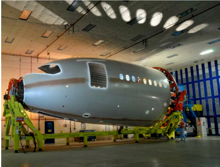
Figure 1 Boeing 787 Dreamliner forward fuselage manufactured by Spirit Aerosystems (3)