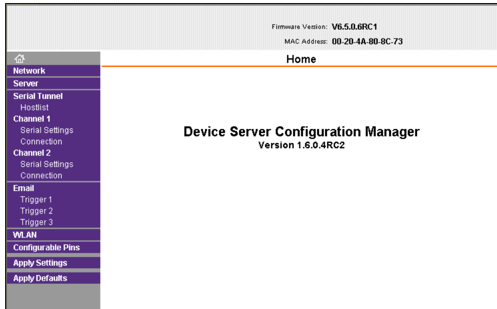
Figure 4-2. Web-Manager

The Web-Manager displays. The main menu is in the left pane of the Web-Manager page.