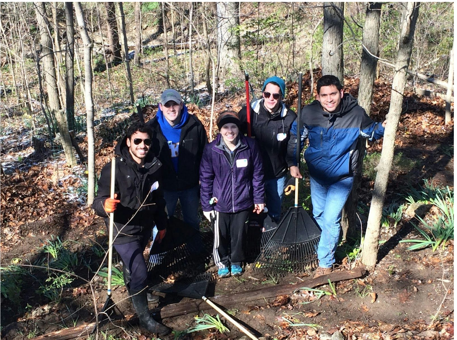
April 9: Volunteers at Springification!