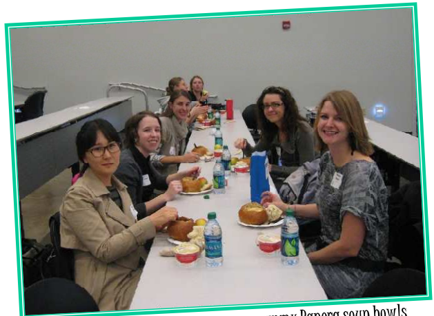
Participants discussed concerns over yummy Panera soup bowls

Please visit the GMP Facebook page for instructions on how to access the meeting video and/or the speakers' presentation.