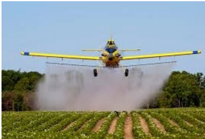
Safety and assurance (agdaily.com)