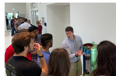
SCHAUFLER Academy, Rottenburg (IRCC 2022)