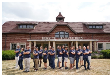
Participants (IRCC 2019) at Purdue University, West Lafayette IN (USA)

Discover interesting lectures, excursions and laboratory work in the fields of thermodynamics, energy utilization and process technology , investigation of physical properties and environmental protection with the application in refrigeration and compressor technology!