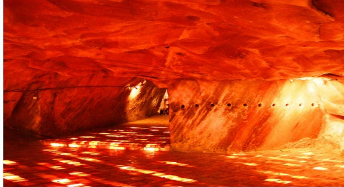
Salt Mines (Pakistan)