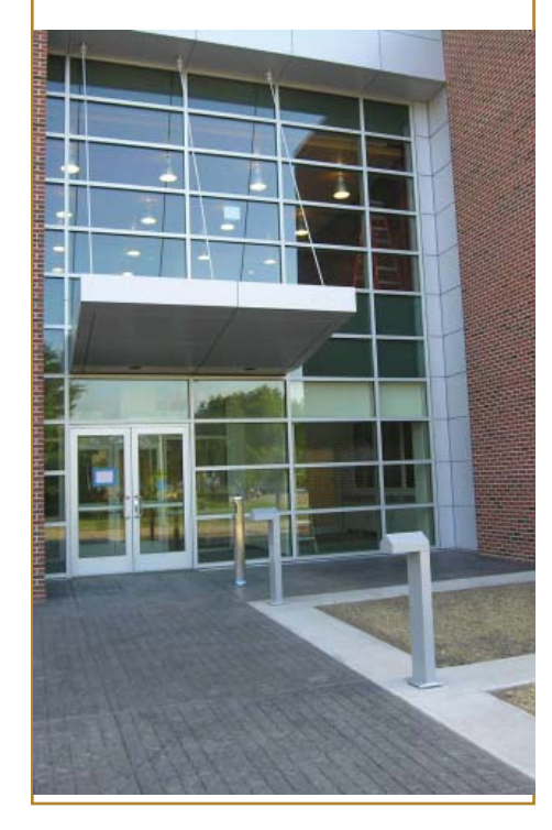
Main entrance just off Russell Street