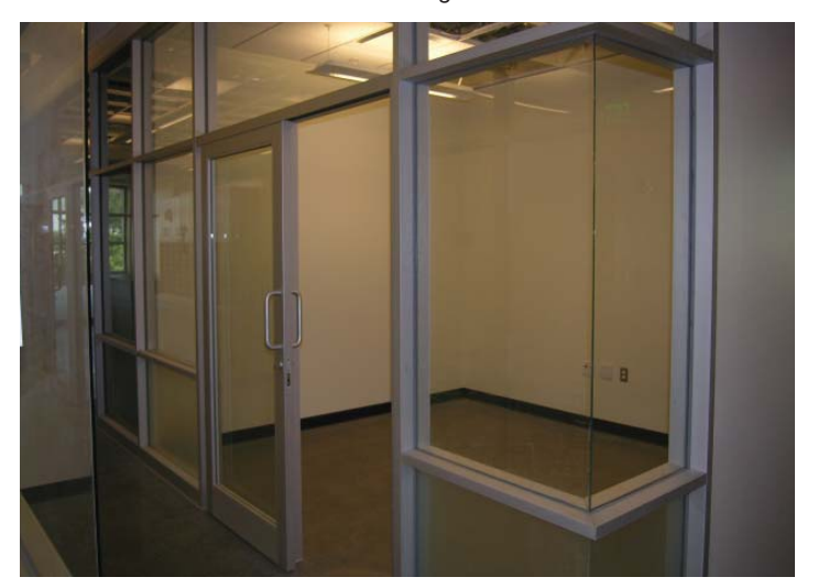
Administrative office on 2nd floor