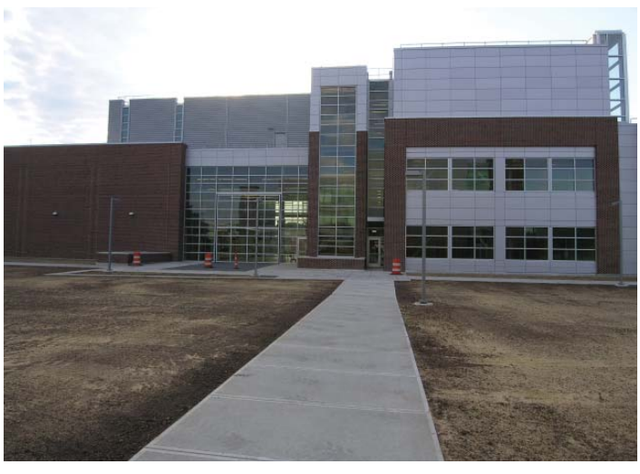
View from west side of buildiing