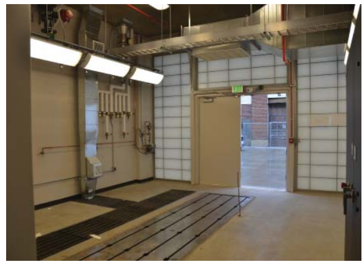
One of 4 engine test cells