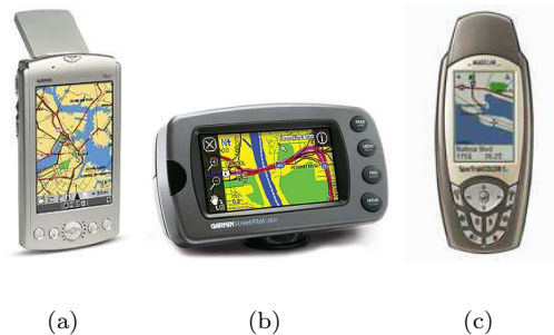
Figure 1: (a) Navigation PDA. (b) GPS for vehicles. (c) Handheld GPS.

wireless communication, and GPS has provided new opportunities for research in image acquisition, processing, analysis, interpretation, and presentation.