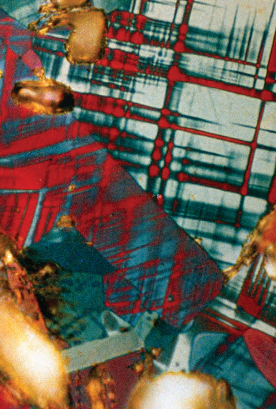
Micrograph of yttrium barium copper oxide, a high-temperature superconductor.

studied images of the pseudogap. Patterns in the images, taken with a scanning tunnelling microscope, often seem disordered to the human eye because of the material's naturally chaotic and fluctuating nature, and noise in the measurements. The advantage of machine learning in this situation is that algorithms can learn to recognize patterns that are invisible to people.