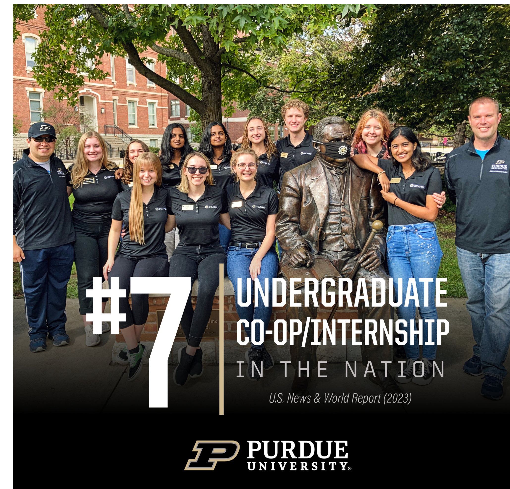
Purdue's Co-op Program is ranked #7 in the nation via U.S. News & World Report.

Co-op is a voluntary & rotational program, where students are required to complete a minimum of three work sessions to earn a degree certificate (equivalent to about one year of professional work experience).