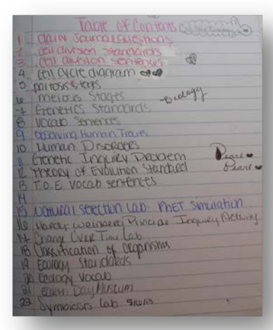
Example of Student notebook Table of Contents