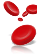
Human Blood Cell

Put the following things in order from smallest to largest