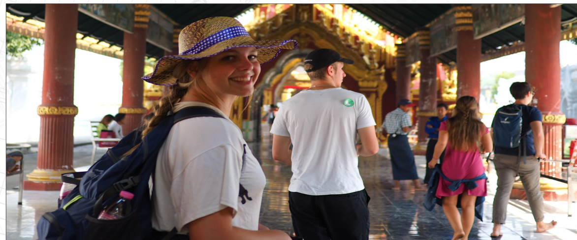
Students on the CAPAsia Field Study Program.

Travel is essential to the education of designers by exposing them to a rich array of diverse cultures and examples of the built environment. Our students visit significant sites, attend conferences, and join field study programs nationally and internationally. Travel opportunities include our college-wide Field Trip Week and course-based international trips to Africa, Asia, Central America, or Europe.