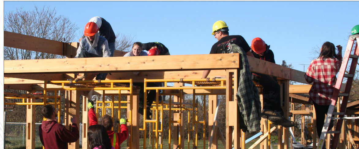
Student team for the design build of the Maring Hunt Library Community Garden Market