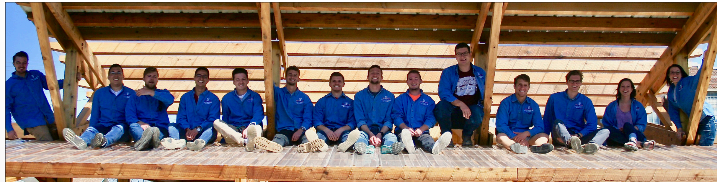
Hands-on learning occurs in this design build studio as students work with the community to address food insecurity by creating a pavilion where growers from the community garden can share their produce with the neighborhood.

*Certificate Focus, Dual Degrees, or professional practice and licensure.