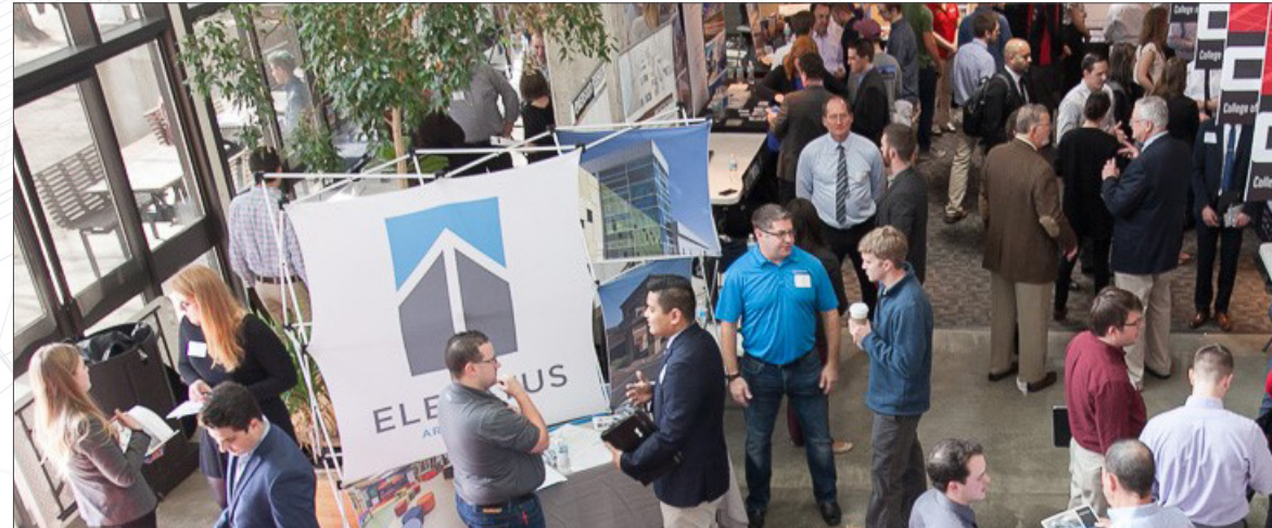
Students meet with more than 80 potential employers from the best firms throughout the country during our annual job and internship fair each spring in the Worthen Arena Concourse.

Architects combine design skills with technical knowledge to both critically investigate and develop responses to issues of people and the built environment. Within the field of architecture, there are diverse opportunities for how one might practice, engage, and build. Projects range from large to small, institutional to residential, adaptive reuse to new construction.