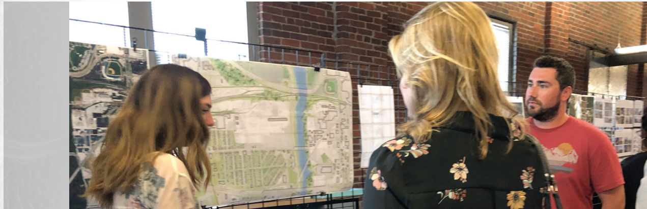
An open critique and review of work in the Ball State CAP: INDY studio.