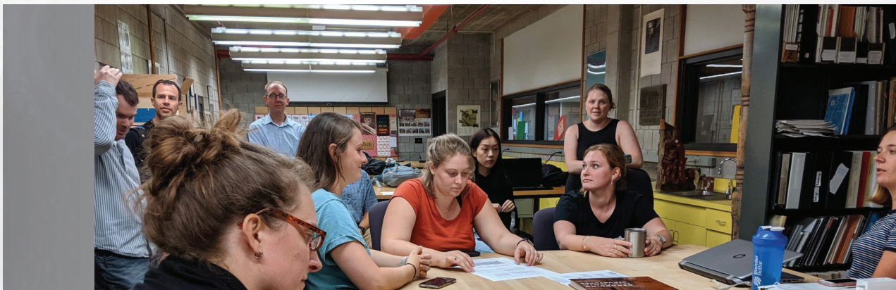
Historic Preservation and M.Arch dual degree students with professors in the Estopinal College of Architecture and Planning.