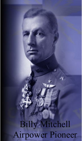
Billy Mitchell Airpower Pioneer