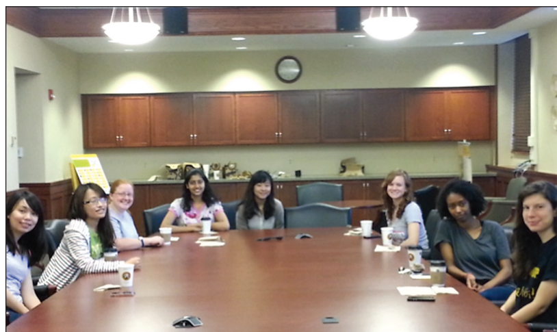
June 2013 gathering

A School initiative started three years ago, the Graduate Women Gatherings (GWG) is a group of women graduate students in chemical engineering at Purdue who meet to support each other. Bagel breakfast is the most popular GWG activity, which gives women in the school a chance to network, learn from each other's experiences and get advice for a successful experience throughout graduate school. During these events, women enjoy bagels and coffee and, more importantly, talk with women in the School who are at different points in their PhD program and from different research groups. All the members look forward to these gatherings and always have a great time!