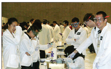
Chem-E Car Team in competition

The Purdue student chapter of the American Institute of Chemical Engineers (AIChE) started the academic year by introducing new chemical engineering students to the organization via a callout in early fall