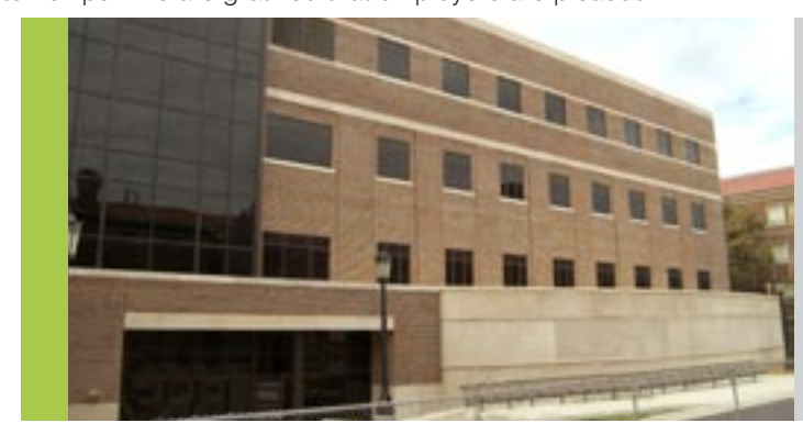
Forney Hall of Chemical Engineering

Our faculty continues to be recognized for excellence. Several are conducting research in areas such as combinatorial catalysis, molecular simulations, novel energy sources, insulin delivery, and pharmaceutical engineering which have tremendous commercialization opportunities. This is an exciting way for faculty to see that the results of their research have applications beyond the ChE laboratories. Such achievements strengthen our programs and enhance the school's international reputation.