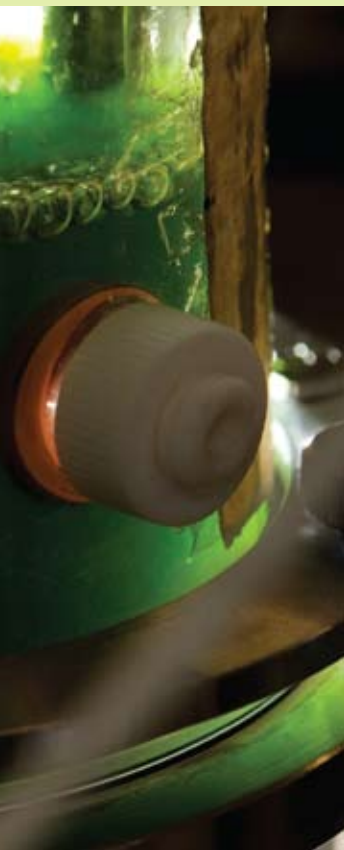
LEFT: Chlamydomonas (algae) cells being grown in a photobioreactor.