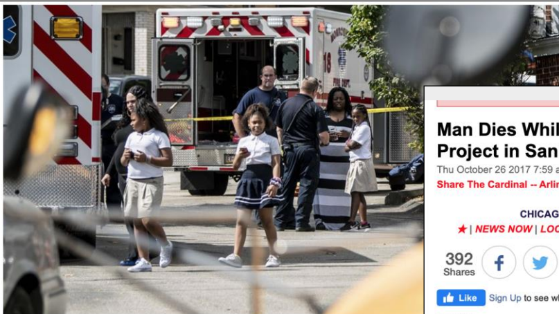
Construction fumes sicken six at Propel Schools Pitcairn