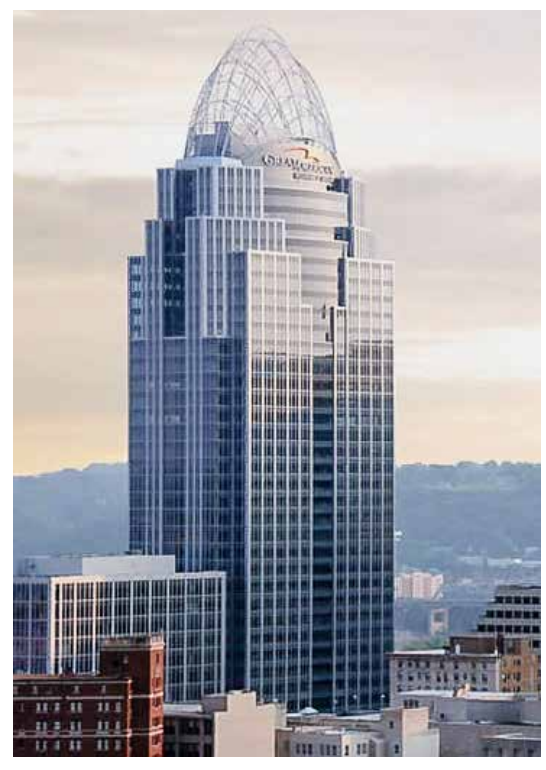
Queen City Square, Cincinnati, OH