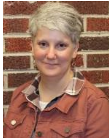
Heather Philhower Architectural Structures Geomatics