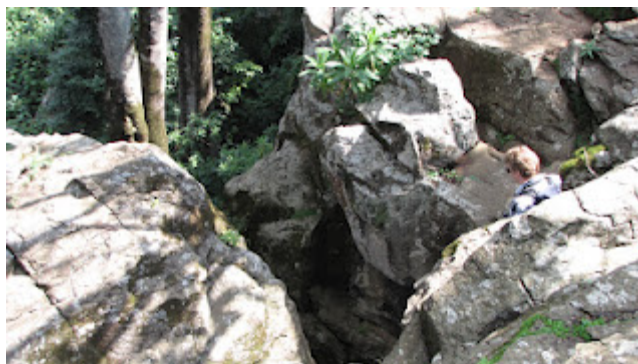
rocks we climbed down to get to the waterfalls