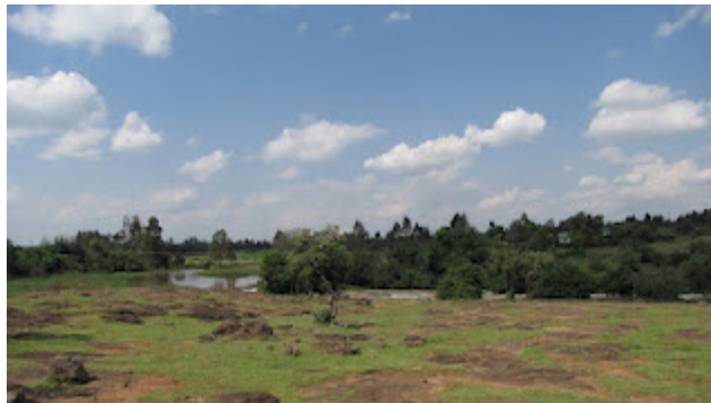
Nice lazy looking river

Sunday afternoon I went with a group to Umbrella Falls.