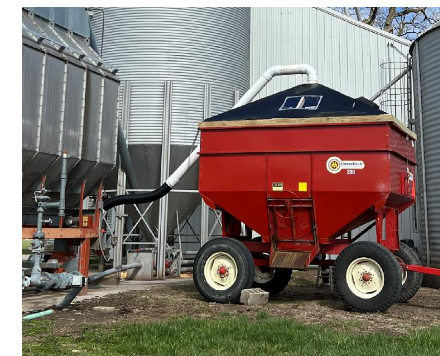
Figure 4 Final Design

The final design utilized the same top built in the prototyping phase with several additions. sealant was added along with spray foam in the corners in order to make it as air tight as possible. A flexible fill pipe was put in place with an easily connectable fitting. The infrared sensor was also added later due to an original shipping delay.