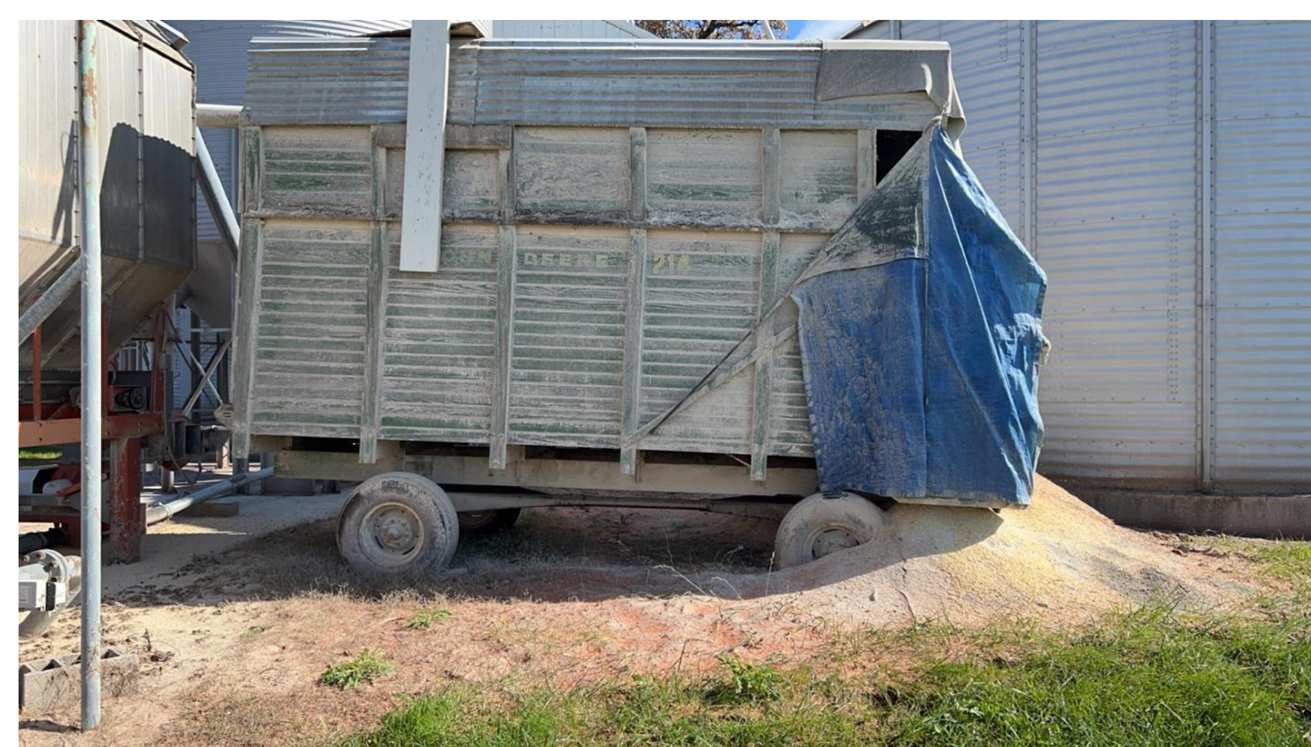
Figure 1 Initial Containment System

The original system at ACRE for containment was comprised of a stationary pipe that slid through a hole in the back of a silage wagon. The silage wagon was fitted with a tarp which covered the front opening. This system lacked in effectiveness and often led to plugging and overflowing.