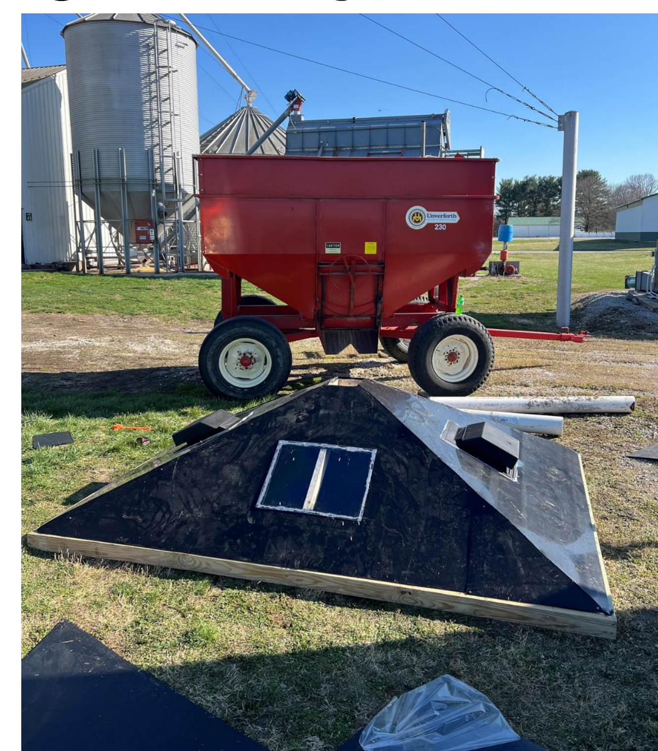
Figure 3 Construction

This is a picture of the roof during the construction process. There are two vents in the top and 2 sheets of Lexan so it can be easily seen into from the ground.