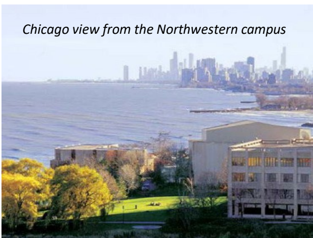
Chicago view from the Northwestern campus