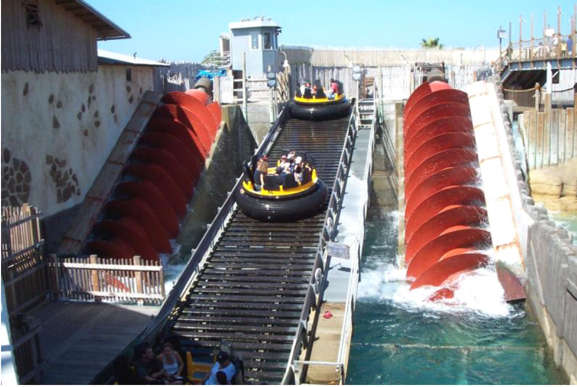
Archimedes screws at the SeaWorld Adventure Park

https://www.math.nyu.edu/~corres/Archimedes/Screw/applications/SeaWorld_screw_big.jpg